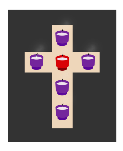
Good Friday, March 29 Light 5 purple candles and 1 red candle, then extinguish 5 purple candles and 1 red candle.