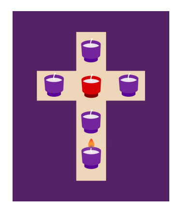
Light 1 purple candle at base