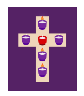
March 3-9 Light 3 purple candles