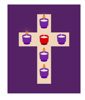
March 10-16 Light 4 purple candles