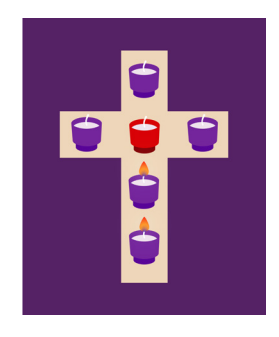
February 25 - March 2 Light 2 purple candles