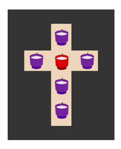
Holy Saturday, March 30 No lights