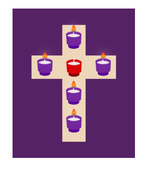
March 17 – 23 Light 5 purple candles